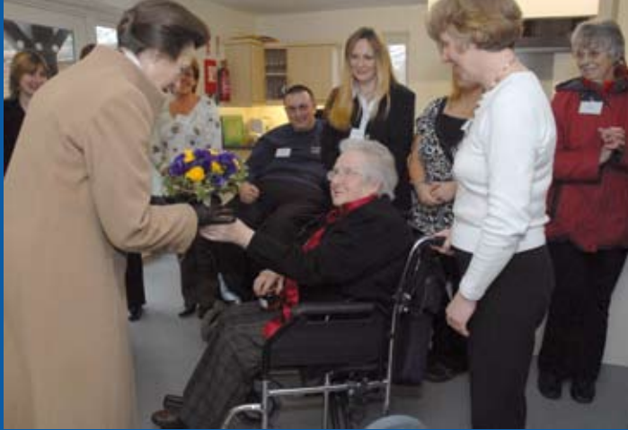
Official Opening: 7 Feb 2008

Set within 350 acres of diverse landscape, woodland, heathland and meadows, The Barn at Holton Lee is particularly appealing to artists, disabled people, carers, groups, conference delegates and those looking for a retreat.